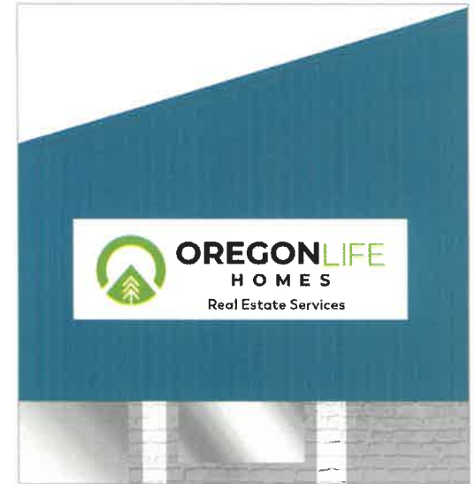
Proposed Day View

FOR ILLUSTRATION ONLY. NOT GUARANTEED DRAWN TO SCALE.